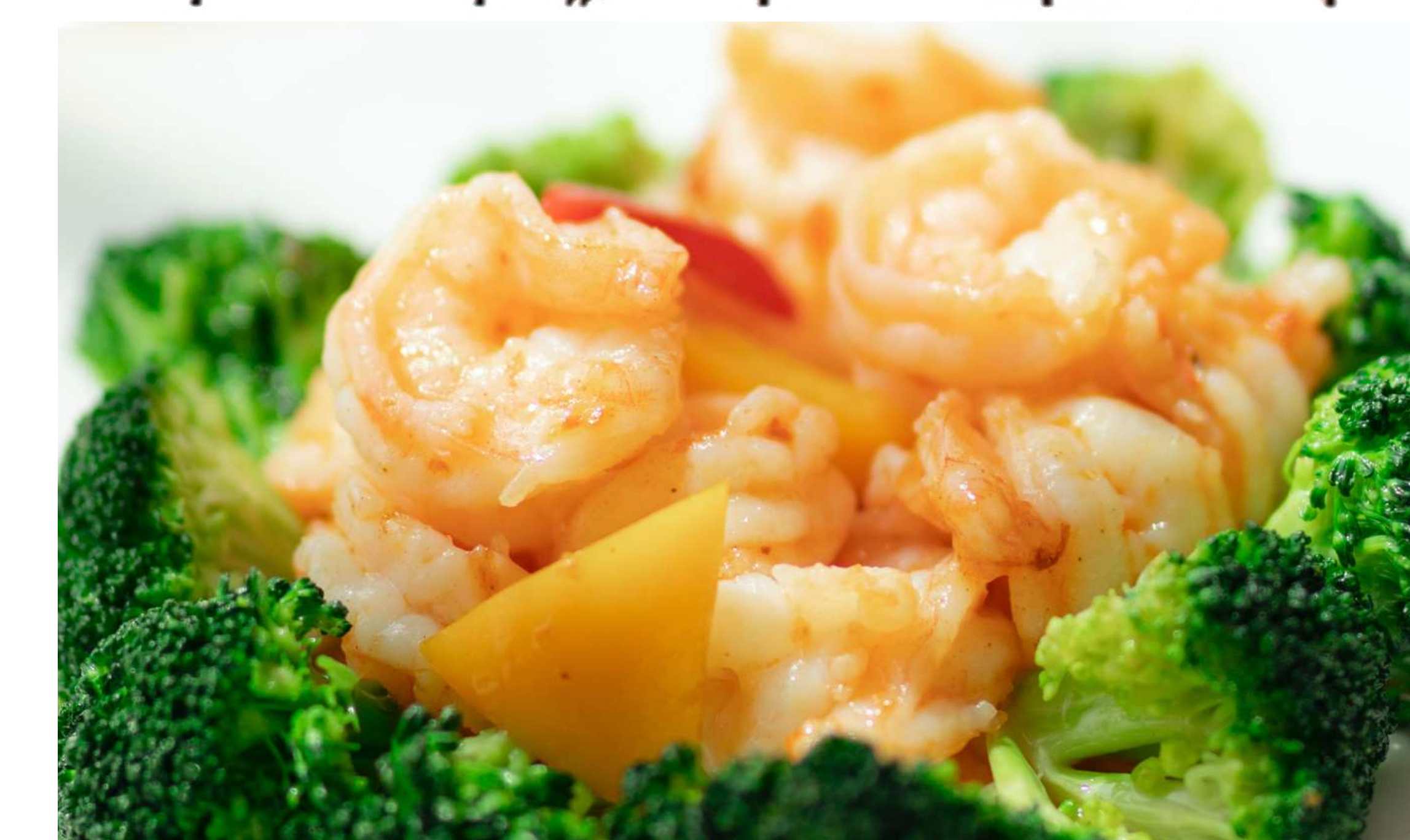
Shrimps and Broccoli