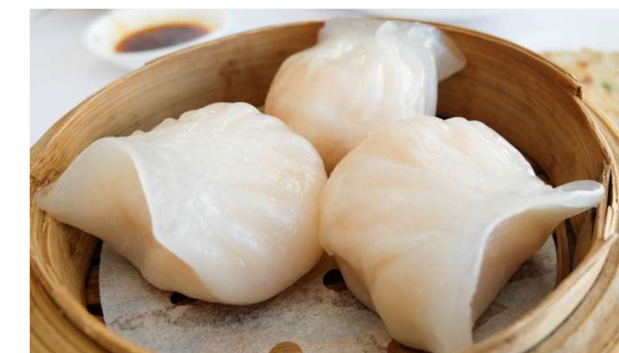
Crystal Shrimp Dumpling $10.40