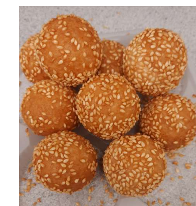
Sesame balls with red bean filling $5.99